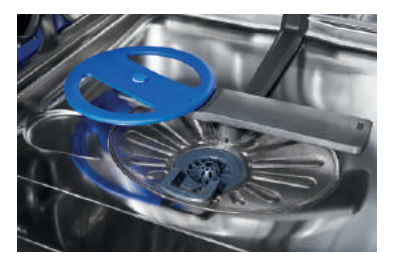
LuxCare<sup>™</sup> Wash Arm Uses Water More Effectively for an Effortless Clean

Enjoy brilliant drying with our Perfect Dry™ System, which circulates air evenly for a complete dry.<sup>1</sup>