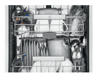
Perfect Dry<sup>™</sup> System Ensures a Brilliant Dry

Enjoy brilliant drying with our Perfect Dry™ System, which circulates air evenly for a complete dry.<sup>1</sup>