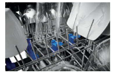
Effortlessly Clean Hard-to-Reach Corners with Target Wash Zones Take aim — special nozzles deliver a targeted wash to clean all sizes and shapes of dishes that need a little extra attention.

Dishes come out sparkling between courses with our thorough 30-Minute Clean.