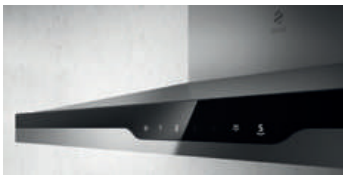
LED light with dimmer