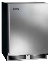
Wine Reserve Solid Door

Capacity 20 wine bottles ( on four shelves )