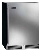
Wine Reserve Solid Door

Capacity 40 wine bottles ( on five shelves ) + room on floor