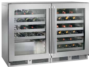
Wine Reserve (Single or Two Temp) Glass Door