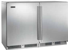
Wine Reserve (Single or Two Temp) Solid Door

48" SIGNATURE SERIES 48" W x 34-1/4"H x 24"D