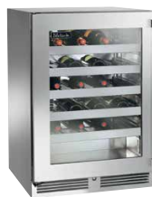
Wine Reserve Glass Door