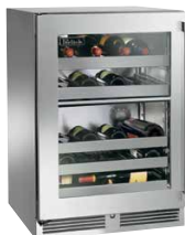
Dual-Zone Wine Reserve Glass Door