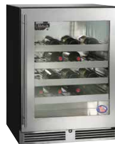
Wine Reserve Glass Door