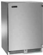
Dual-Zone Wine Reserve Solid Door