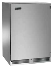
Wine Reserve Solid Door

24" SIGNATURE SERIES 24" W x 34-1/4"H x 24"D