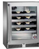
Wine Reserve Glass Door