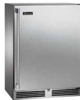
Wine Reserve Solid Door

Capacity 14 wine bottles ( in top zone ) + 18 wine bottles ( in bottom zone )