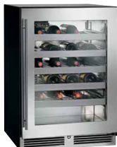
Wine Reserve Glass Door