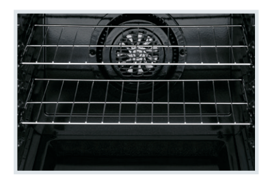
One-Touch Quick Self Clean Your oven cleans itself — so you don't have to. Self clean options available in 2-, 3- and 4-hour cycles.