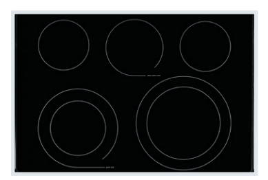
Fits-More™ Cooktop with SpaceWise® Expandable Elements

The cooktop features five burners including two SpaceWise® Expandable elements and a Warming Zone so you can cook more at once.