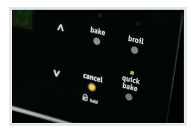
Quick Bake Convection Bake faster and more evenly with Quick Bake Convection.