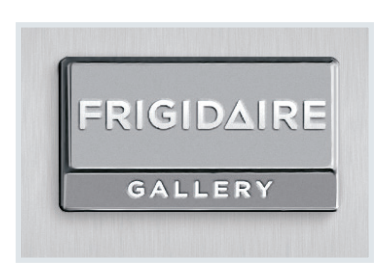
Smudge-Proof<sup>™</sup> Stainless Steel Resists fingerprints and cleans easily.