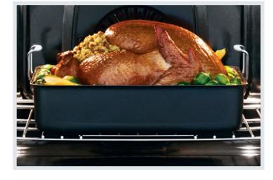
One-Touch Options Our ovens feature easy-to-use one touch buttons so you can add a minute to the timer, or keep foods warm - with the touch of a button.