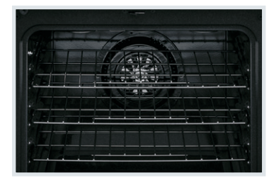
One-Touch Quick Self Clean Your oven cleans itself — so you don't have to. Self clean options available in 2-, 3- and 4-hour cycles.

True Convection Single convection fan circulates hot air throughout the oven for faster and more even multi-rack baking.