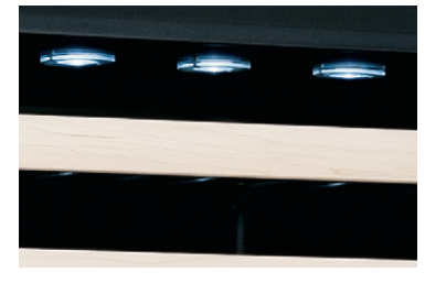
Theatre Lighting Transition LED lighting gradually illuminates the interior with soft but ample light as you open the door.