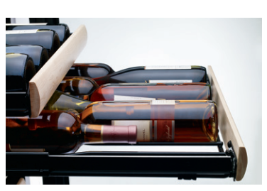
Smooth-Glide<sup>®</sup> Racks With a ball bearing system, racks smoothly extend with the touch of a finger for effortless access.