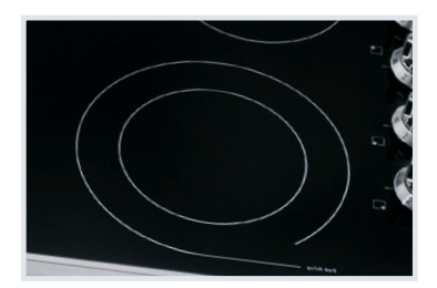
SpaceWise® Expandable Elements Flexible elements expand to your cooking needs.