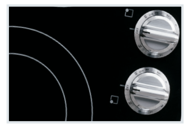
Express-Select® Controls Easily go from warm to boil.