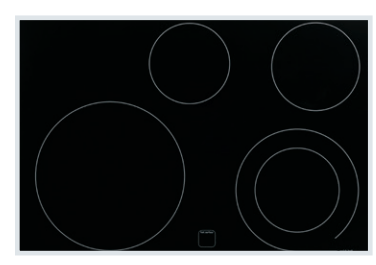
Ceramic Glass Cooktop For a more beautiful cooktop that's easy to clean.