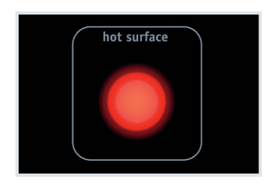
Hot Surface Indicators