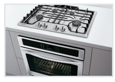
Approved Over Frigidaire® Electric Wall Ovens Cooktops are approved for installation above any of our Single Electric Wall Ovens.