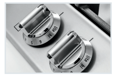
Express-Select® Controls Easily go from warm to boil.