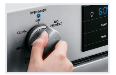
PowerPlus® No Preheat Oven is ready in no time. Start baking immediately with PowerPlus® No Preheat.<sup>1</sup>

PowerPlus* Dual-Fan Convection Powerful performance delivers consistent results. Evenly cooked dishes, every time, with PowerPlus* Convection Bake and Roast.