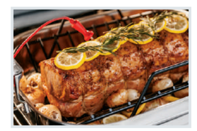
PowerPlus® Temperature Probe Ensures great results the first time. Set and monitor dish temperature with the PowerPlus® Temperature Probe.