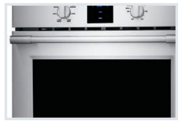
Smudge-Proof™ Resists fingerprints and cleans easily.