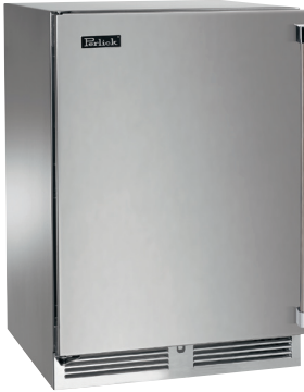
Solid Door Model

Perlick ® QUALITY & INNOVATION THAT INSPIRES