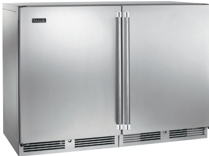
All Solid Door Model