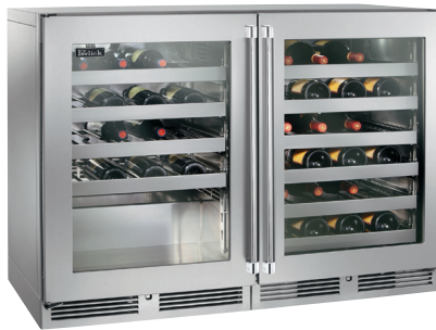
All Glass Door Model