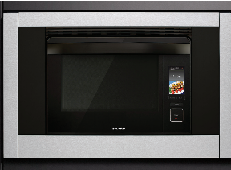
Flush mount installation shown.