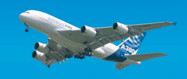
Aerospace and Transportation System

including earthmoving, mining, tower and maritime cranes, aerospace and transportation systems, machine tools and automation systems. For over 65 years, The Liebherr Group's goal has been twofold: design superior products, and treat our customers and employees like family.