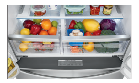
Auto CrispSeal<sup>™</sup> Crisper Drawers Keep produce fresh, so you waste less food and save more money.