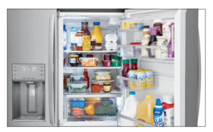
OpenAccess<sup>™</sup> Door Makes grabbing your fresh favorites easier. Reach up to 75% of your fresh food by opening just one door.