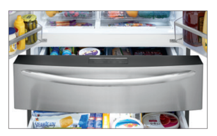
Custom-Flex® Temp Drawer Can refrigerate or freeze your favorites. Customize your storage space to fit more of your family's favorites, from yogurt to beer to frozen pizza. This middle drawer can be set anywhere from -6° to 45°F, the widest range in temperature settings on the market.