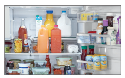
SpaceWise® Organization System Easily access your most-used items with adjustable storage, including a flip-up shelf to fit taller items and an expandable door bin.