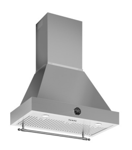
K36HERTX + KC36HERTX Stainless steel canopy