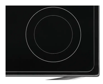
SpaceWise® Expandable Elements Flexible elements expand to meet your cooking needs — big or small.