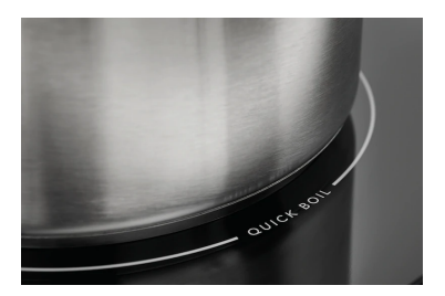
Quick Boil Get meals on the table faster with our 3,000W element - water boils faster than the traditional setting.