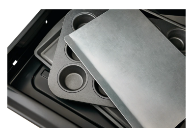
Store-More™ Storage Drawer With the Store-More™ Storage Drawer, you will have extra space to store your cookware.