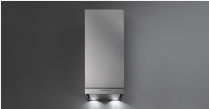
Photograph is for information purposes only May not correspond to the selected version