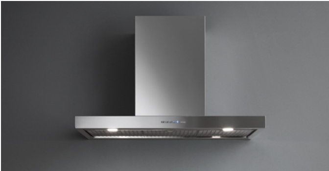
Photograph is for information purposes only May not correspond to the selected version