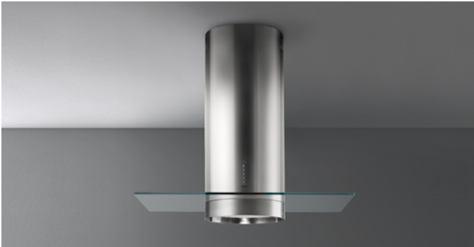
Photograph is for information purposes only May not correspond to the selected version