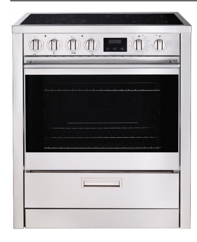
Porter & Charles ranges offer exceptional quality and performance. Aesthetic highlights include clean lines and attention to detail, from the ergonomic handle to the interior light.

Hand assembled and hand finished using the highest quality stainless steel, the quality is not only visual but can be felt. All ranges were designed with the user in mind, with features to make cooking more enjoyable and clean-up as simple as possible.