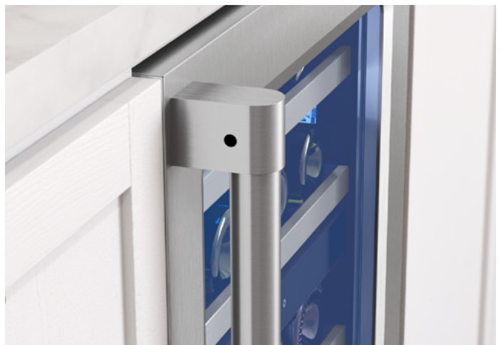
Door Lock in Pro-Style Handle